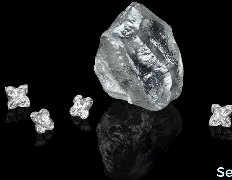
Sethunya, 549 carats

Revenue from shipments in 2020 and 2021 continue to be recognized