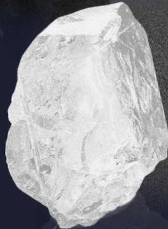
1,109 ct Lesedi La Rona