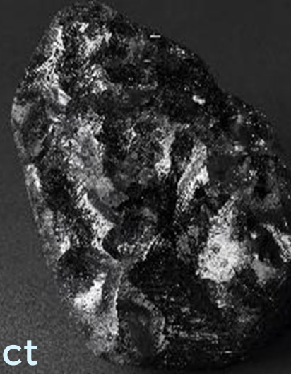
1,758 ct Sewelô