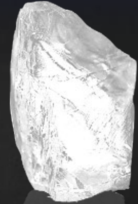
813 ct Constellation