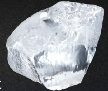
549 ct Sethunya