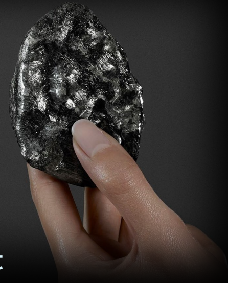
1,758 ct Sewelô