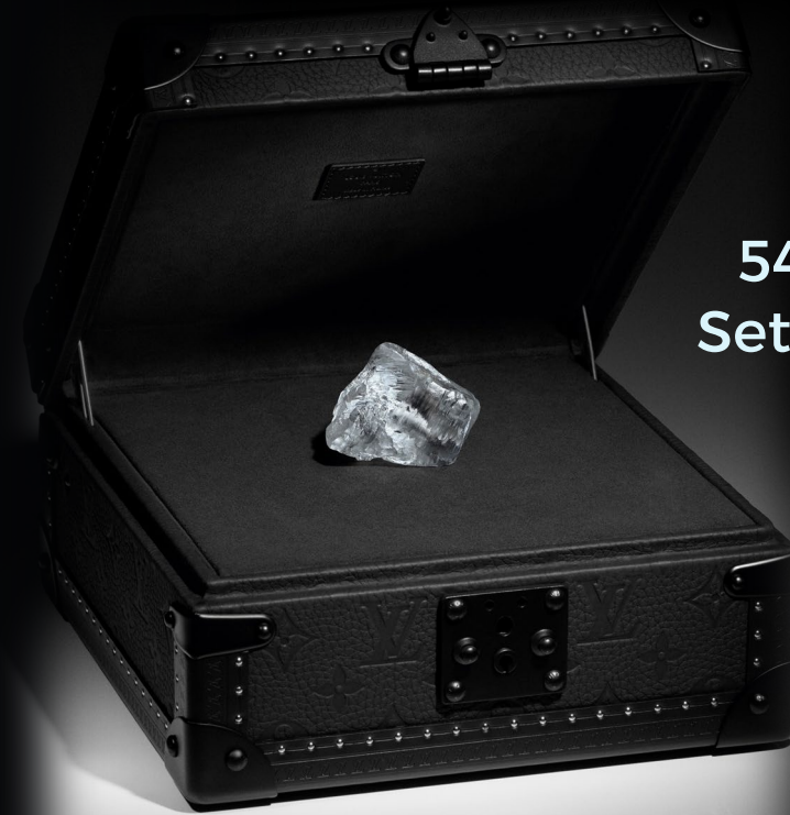
549 ct Sethunya

Lucara will participate in all sales of polished diamonds resulting from the Sethunya and 50% of polished sales resulting from the Sewelô with a further commitment from LV to contribute 5% of all Sewelô retail jewelry sales towards community-based initiatives in Botswana