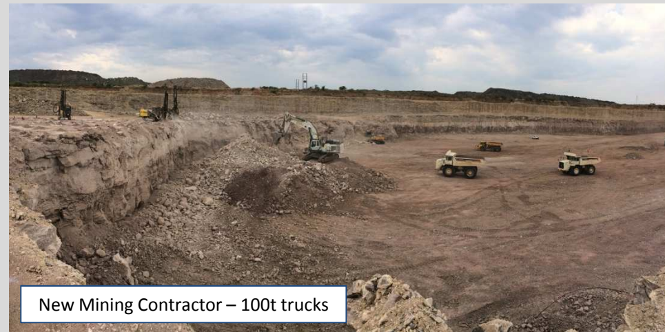
New Mining Contractor - 100t trucks