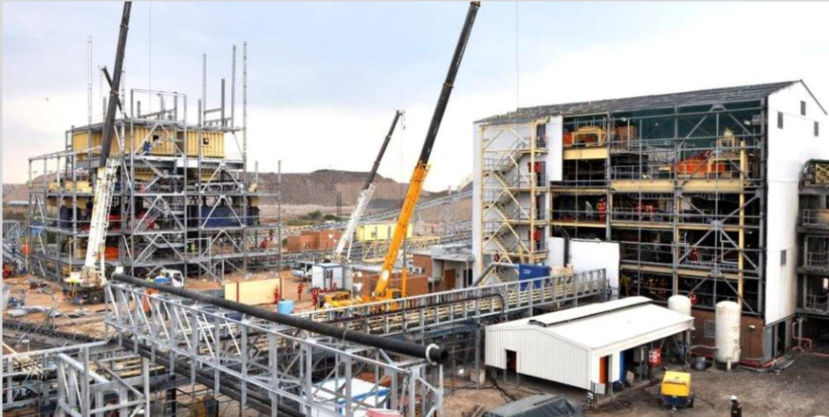
XRT and Recovery Building