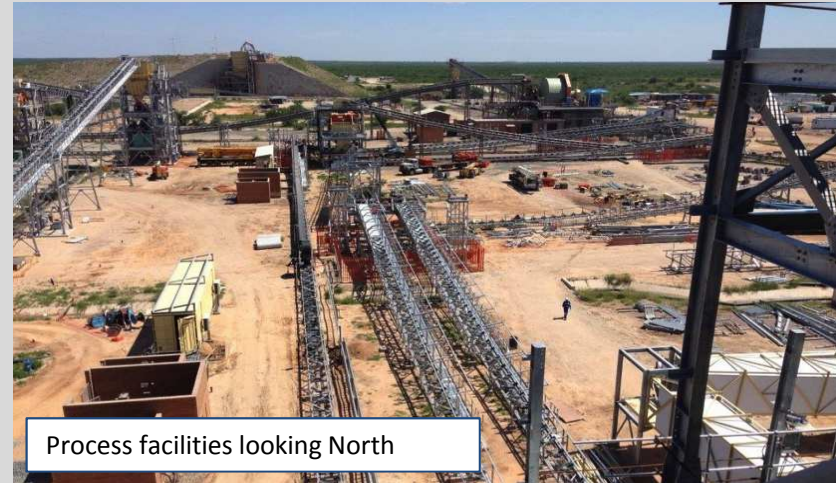
Process facilities looking North